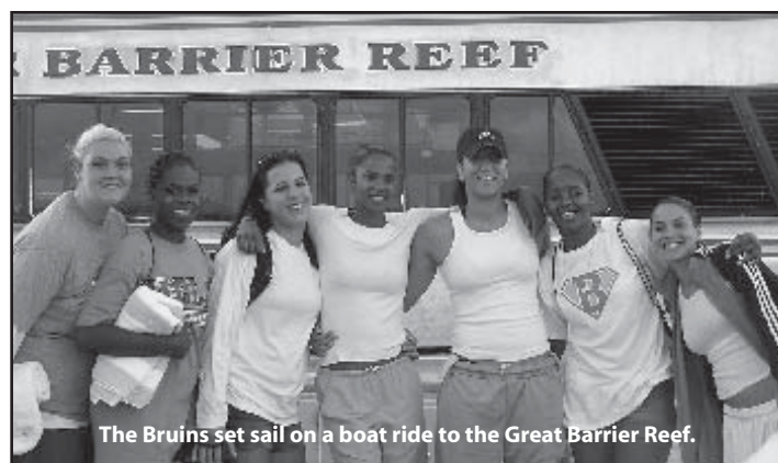
The Bruins set sail on a boat ride to the Great Barrier Reef.