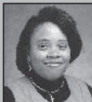
Lori Lamar Event Management