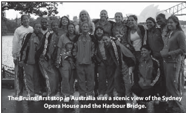
The Bruins' first stop in Australia was a scenic view of the Sydney Opera House and the Harbour Bridge.