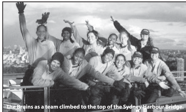
The Bruins as a team climbed to the top of the Sydney Harbour Bridge.